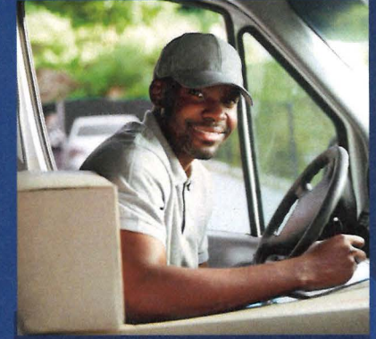
CDL Class B

The program includes OSHA certification in construction safety training and prepares students for AWS certifications.